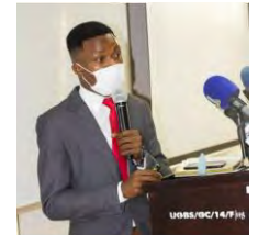
Peter's Call to Action Click here to view